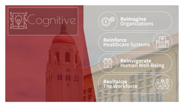
Stanford Rebuild - Innovating for a Post Covid-19 Future